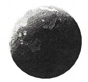
Is there life on Mars?

This belief would then be kin to what is found in Mormonism: namely,